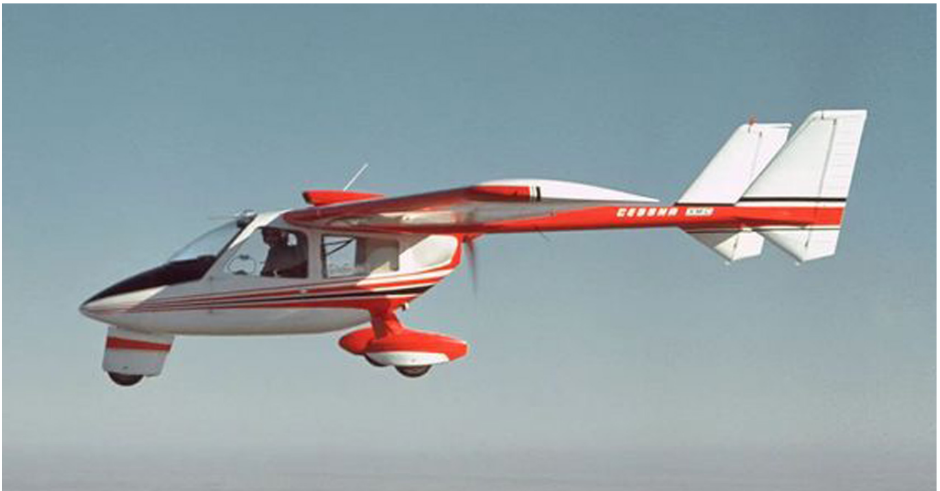
Prototype Cessna that was never produced. it is quite a bit smaller than a Skymaster but was built before the Skymaster